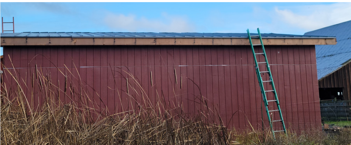
December 3. Reed and Ken mounting metal roof we have on hand.