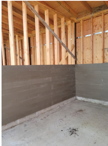
November 17. Missing two pieces of Fiberon — back to Building Materials Bargain Center.