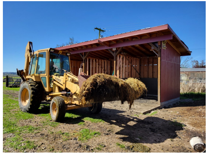
April 7. Cleaning out sheep barn and depositing manure in right bin.