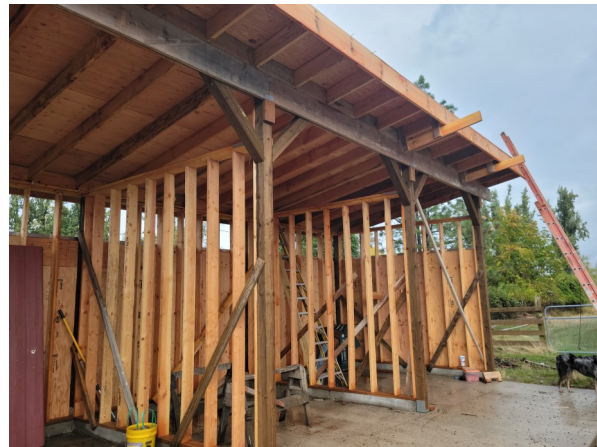
September 28. Roof is on.