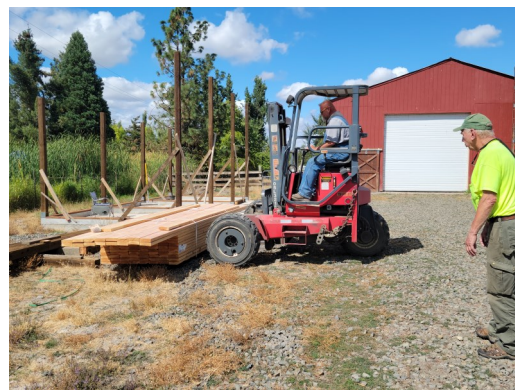
August 26, studs are delivered by Stayton Builder's Mart.