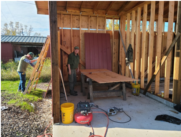
October 31. Cutting and mounting upper siding. Need one more piece of T1-11.