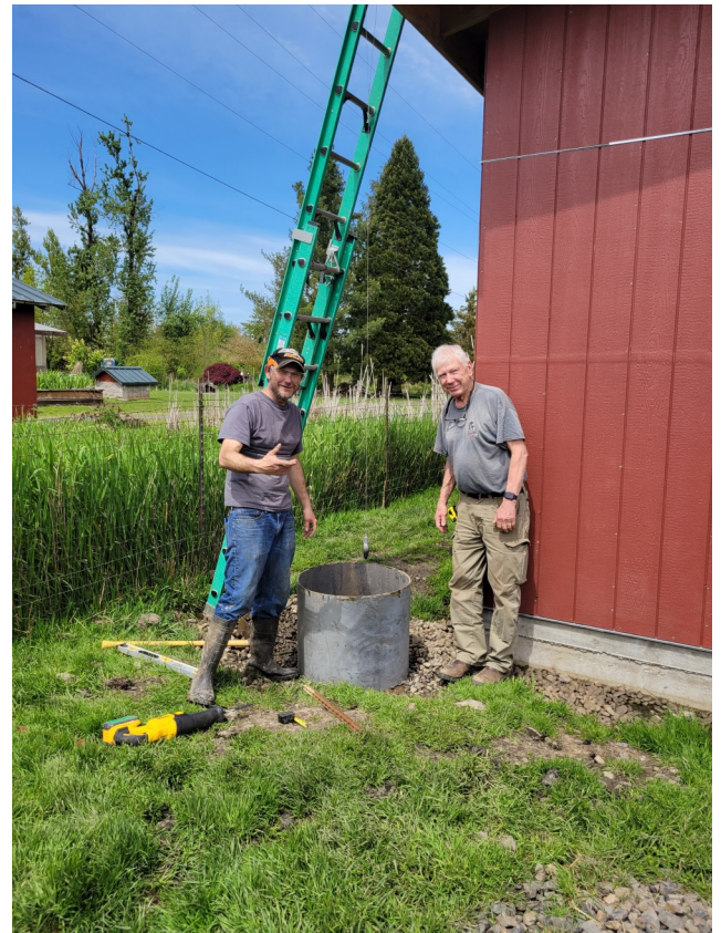
May 4, 2022. Receptacle for downspout installed; attachment made to connect chain at the bottom of receptacle.