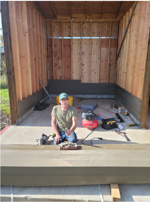
November 8. Installing Fiberon.