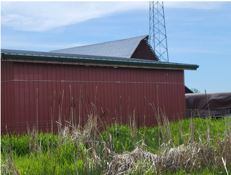
May 3, 2022. Butler Custom Sheet Metal puts up gutter.