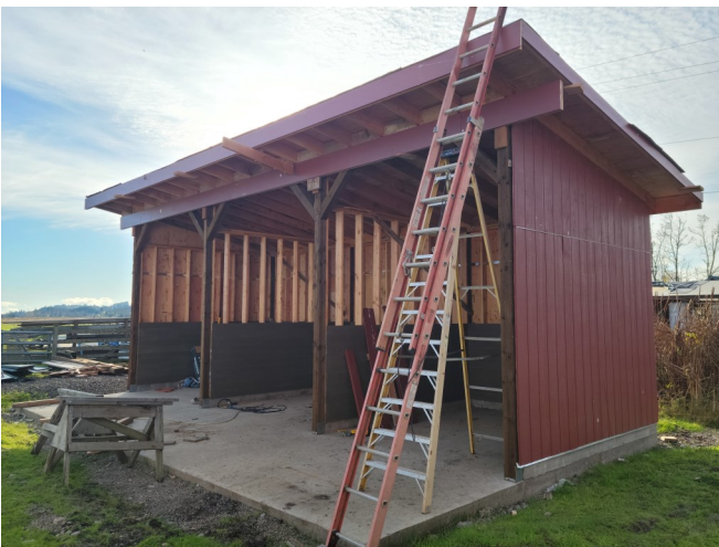
November 28. Waiting for metal roofing from Bruce & Dana which will not be available until March, 2022. Siding boards installed.