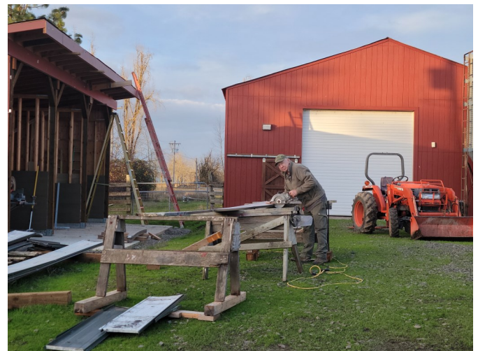
December 2. Ken cutting metal roof panels on-hand.