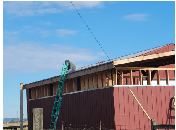
October 31. Membrane on roof. Need another roll of membrane.